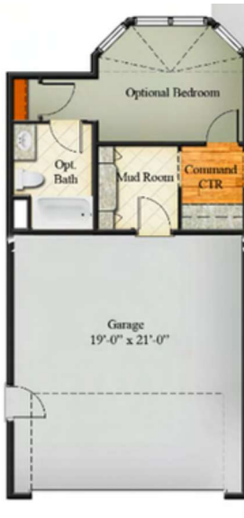
Optional 1 st Floor BR & Bath