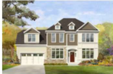
Optional Elevation 2