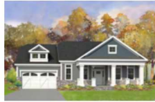
Optional Elevation 1